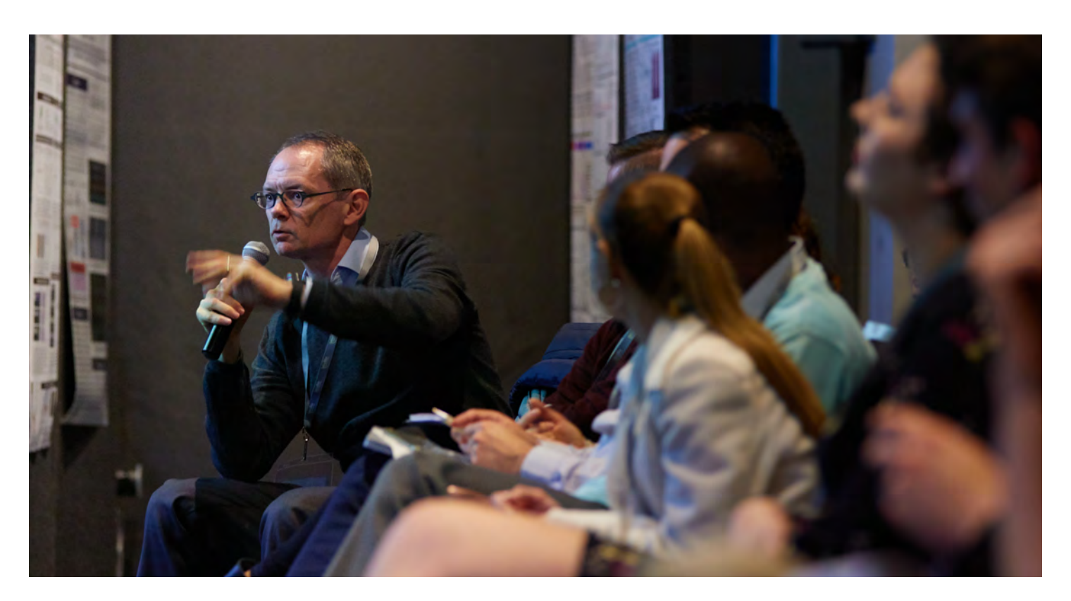
13th International NanoMedicine Conference

You should keep a copy of your application and any supporting documents.