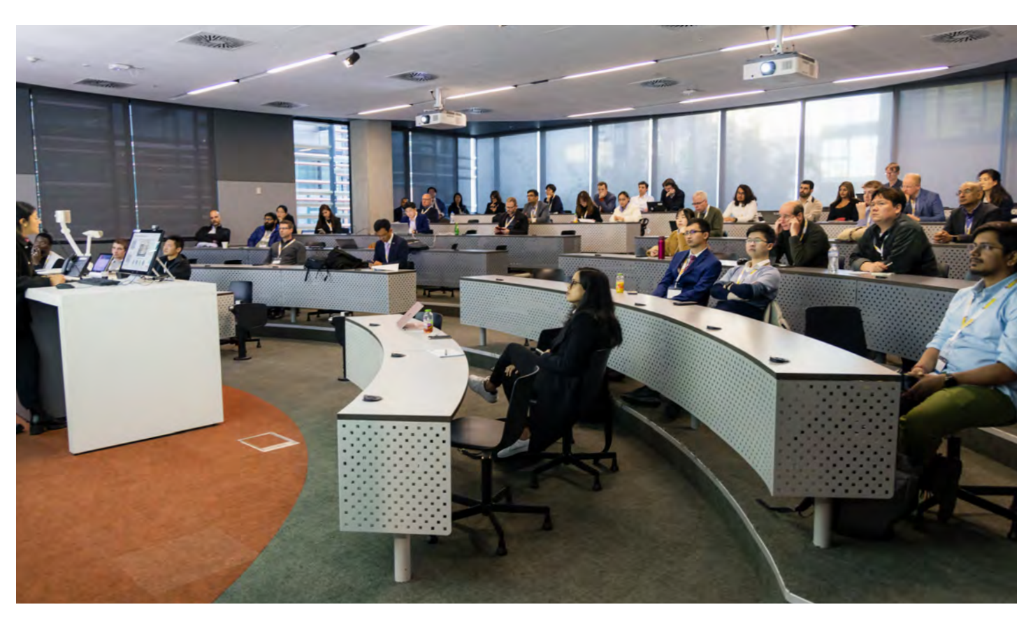
3rd Asia-Pacific International Conference on Additive Manufacturing

The funding agreement may also include any specific requirements about special categories of information collected, created or held under the funding agreement.