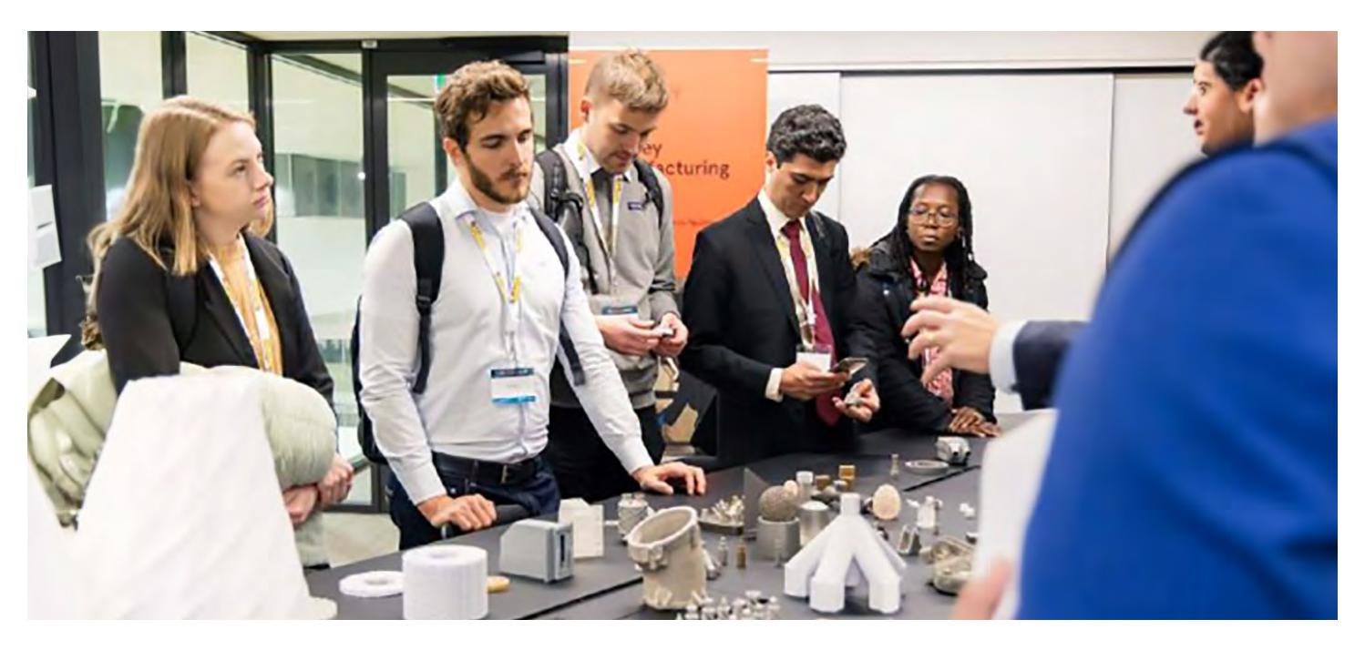
3rd Asia-Pacific International Conference on Additive Manufacturing

Where an application is identified as not meeting the above eligibility criteria, the application may be set aside from further consideration at the absolute discretion of the Department. The Department may also seek clarification from any applicant in relation to its application, including seeking further information on the eligibility or assessment criteria.