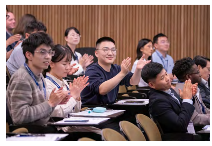
5th Asia Oceania Symposium on Fire Safety Materials Science and Engineering