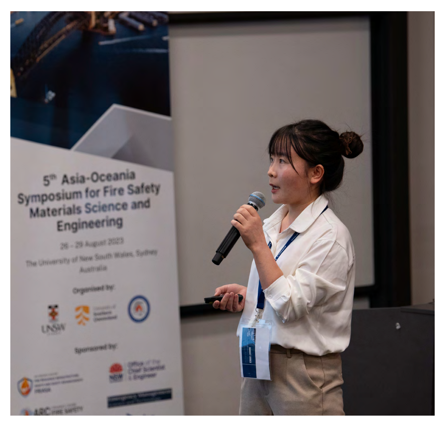
5th Asia-Oceania Symposium on Fire Safety Materials Science and Engineering

All eligible costs will be paid inclusive of GST.