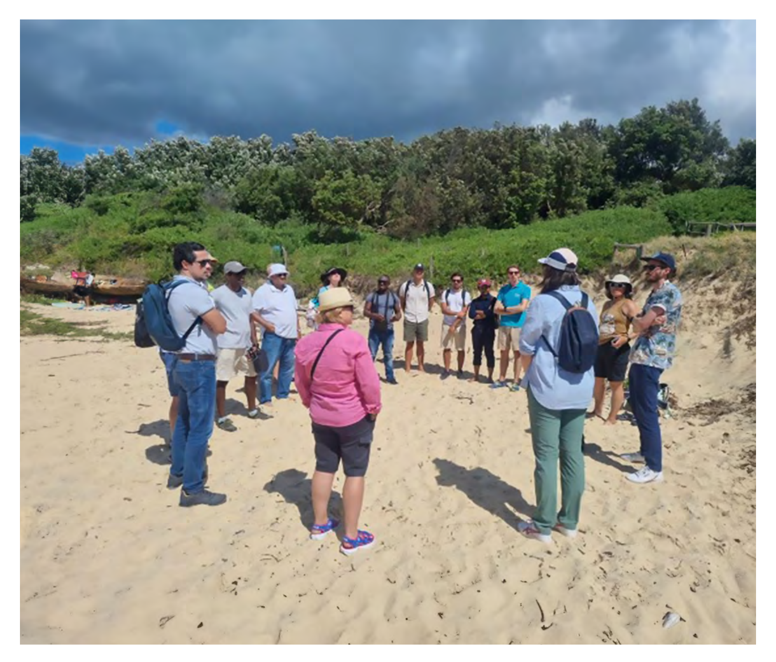
Beaches in Estuaries and Bays (BEBs) Workshop

The applicant must lodge a complaint with the Department in writing and submit it to raap.grants@chiefscientist.nsw.gov.au