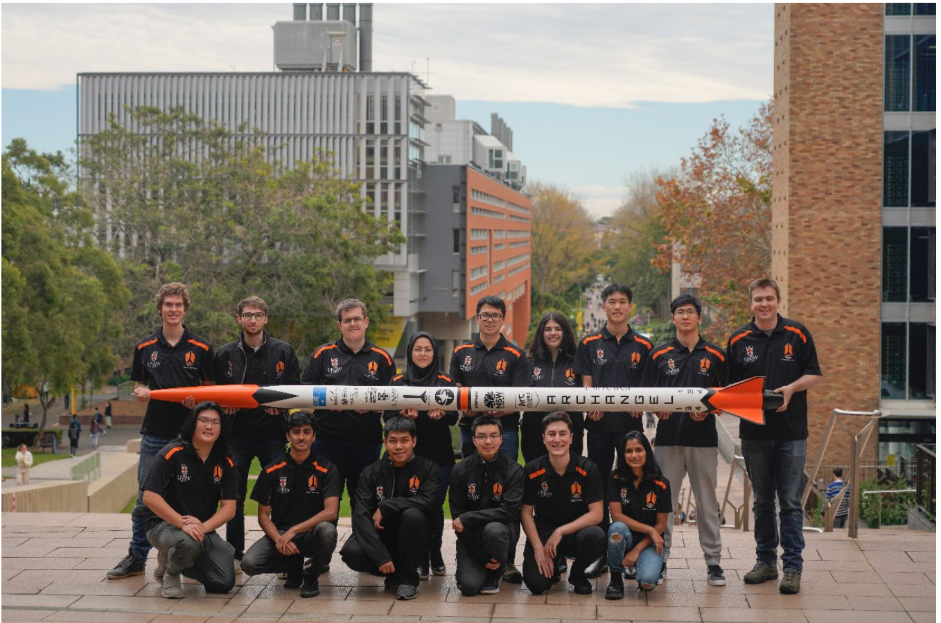
UNSW Rocketry, 2023 Spaceport America Cup

The Department and the NSW Audit Office reserve the right to undertake an audit of Program funding and support within seven years. Tracking and reporting will be a requirement of the funding agreement.