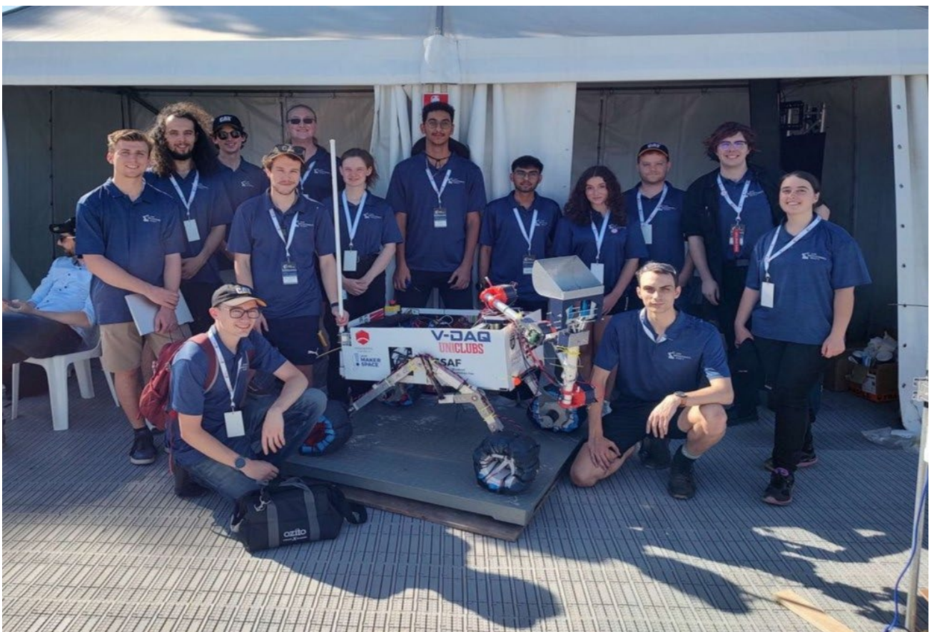
University of Wollongong Mechatronics Engineering Society Rover Team, 2024 Australian Rover Challenge